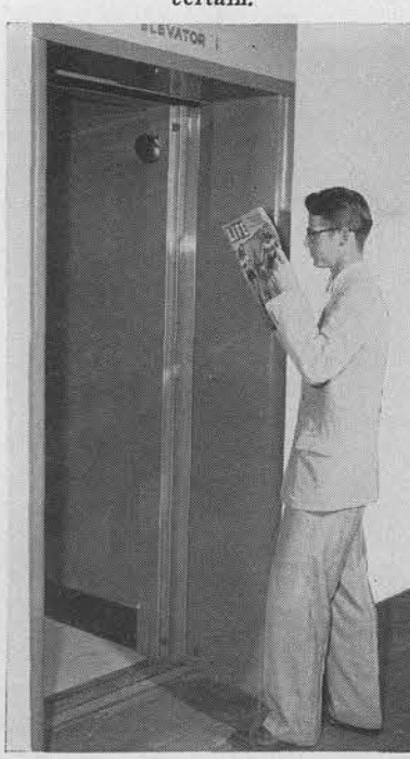
HE NEEDS RADAR to be sure the door is open, the elevator is there and no one is in front of him. Believe it or not, this type of "blind flying" resulted in an injury.